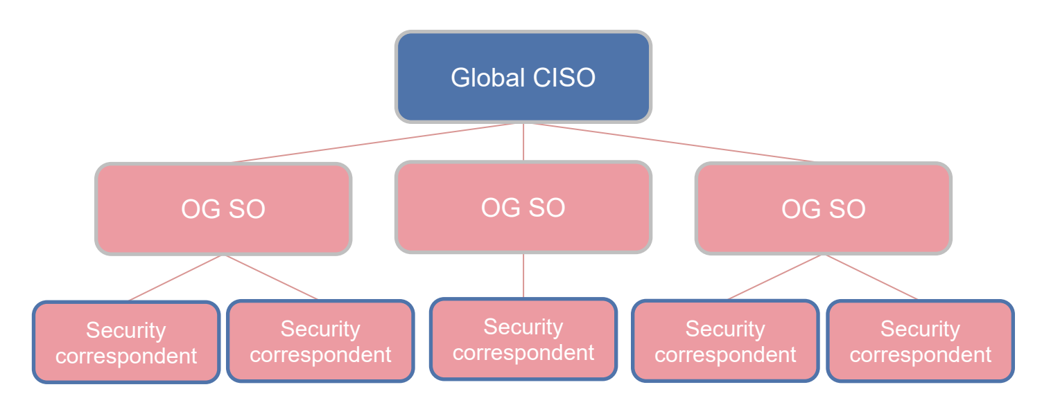
Figure 3 - Organization of the ISS governance of Bureau Veritas

The governance also includes any relevant role for the animation of the information system security within business activities, control functions, project ownership and management.